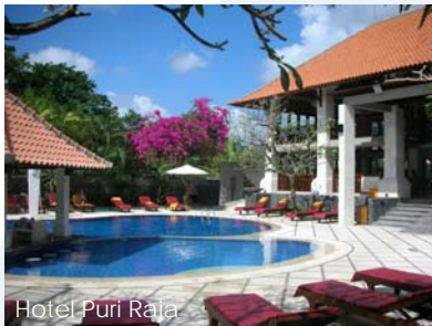
Hotel Puri Raja