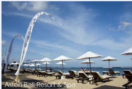
Aston Bali Resort & Spa